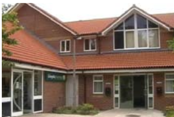
The Woolston Lodge Surgery, Southampton.

I think having an efficient IT system is going to be crucial in the future, but the real advantage I have seen in SystmOne over other providers is the contact TPP have with their users and the way they listen to feedback that has been offered. I think that listening and responding to the needs of people that actually use the technology is essential for us all to move forward and to keep up with the ever changing NHS environment."