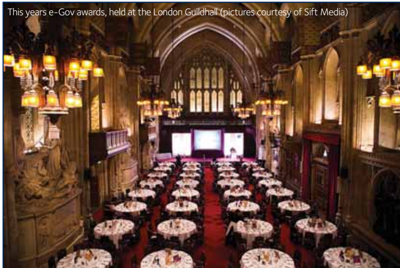
This years e-Gov awards, held at the London Guildhall

"The Prison Health IT programme has been a great example of effective multi-agency working. Against the background of a high security environment and a challenging patient base, the programme team has been providing hard-pressed front-line healthcare staff with a tool which enables them to deliver safer, more effective care – indeed, a standard of care comparable with that available in the wider NHS."